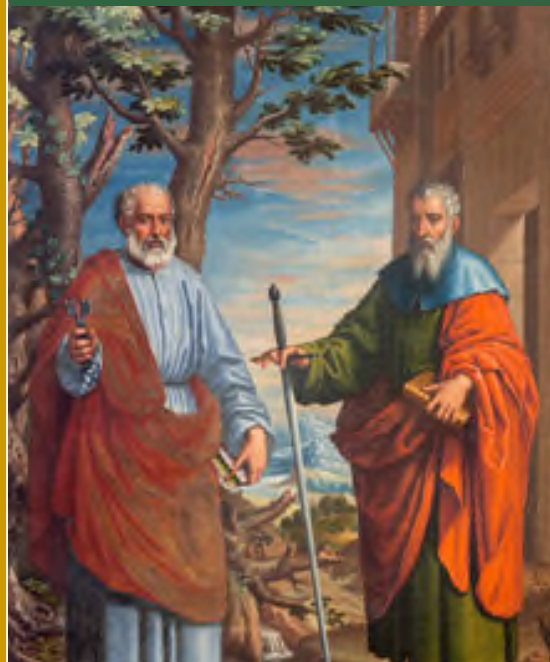
Solemnity of the Apostles SAINT PETER AND SAINT PAUL

Just as God called Peter and Paul, He calls each of us today to find unity, to preach and live the Gospel.