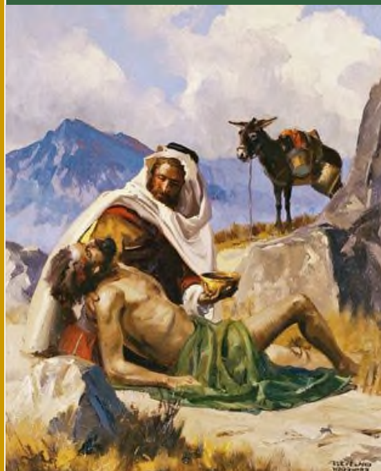
THE GOOD SAMARITAN

The Good Samaritan shows us that when we love our neighbor, we are serving Jesus.